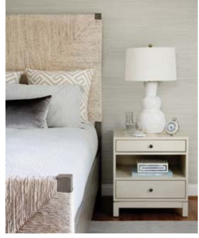
In the owners' bedroom (these pages), a Bernhardt bedstead crafted of woven abaca is flanked by Gat Creek tables and lamps by Regina Andrew. A brass-and-petrified-wood side table sits between Wesley Hall armchairs while a collection of black-and-white framed art adds a graphic touch to the Gat Creek wood dresser.