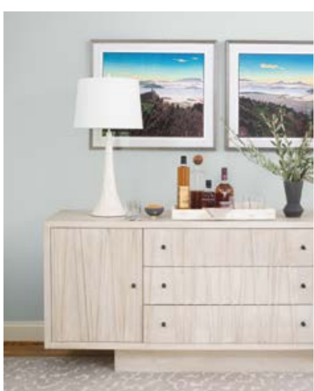
Previous spread: An Arteriors light fixture adds sparkle to the living room, where a Lee Industries sofa and Charleston Forge cocktail table reside. Clockwise from top: A round mirror complements a linear console in the foyer. In the dining room, a Generation Lighting chandelier echoes the rectilinear Copeland table. Japanese-style prints by Tom Killion hang above a sideboard by CFC.